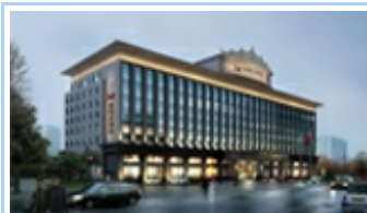
□ □ □ □ □ □ □ □ □